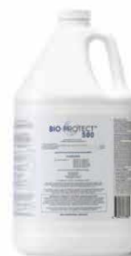
BIOPROTECT™ 500 Antimicrobial Protectant