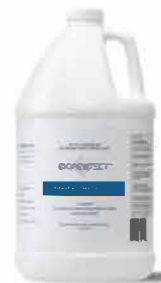
BIOPROTECT™ Hydrating Hand Sanitizer