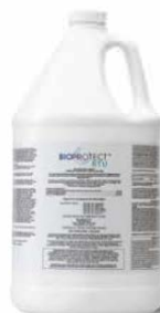
BIOPROTECT™ RTU Antimicrobial Protectant