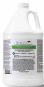
SmartTouch® Hospital Grade Disinfectant